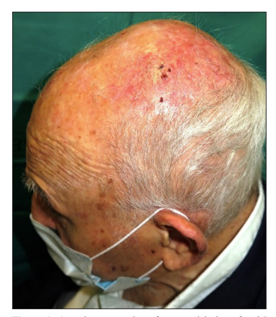
Figure 4: Complete regression of tumoural lesion after 26 weeks.

computed tomography scan showed no abnormal lymph nodes. A new 2 cm non-metastatic CSCC tumour appeared 22 months after the resolution of the lesion and was treated with radiotherapy with no further relapses.