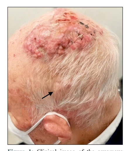
Figure 1: Clinical image of the squamous cell carcinoma and its satellite lesions on the temporal zone. The black arrow indicates the satellite lesion selected for biopsy.

A punch biopsy from a satellite lesion of the temporal zone [Figure 1] was compatible with the diagnosis of an in-transit metastasis of a well-differentiated CSCC [Figure 3a, 3b and, 3c]. The tumour was staged as T3,Nx,M0 by the American Joint Committee on Cancer 8th edition. Cemiplimab was prescribed for treatment when the tumour was deemed inoperable. Approval for treatment was obtained after two months. However, upon the scheduled commencement date for Cemiplimab, a noticeable improvement was observed, with the cutaneous tumour showing signs of flattening. Over the following 12 weeks, progressive amelioration and complete resolution of the lesion were observed without any treatment being started [Figure 4]. Furthermore, a control