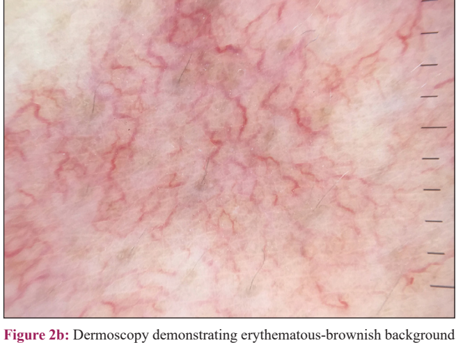
Figure 2b: Dermoscopy demonstrating erythematous-brownish background with prominent angioid streak pattern or linear-irregular branching vessels (polarising, original magnification x10).