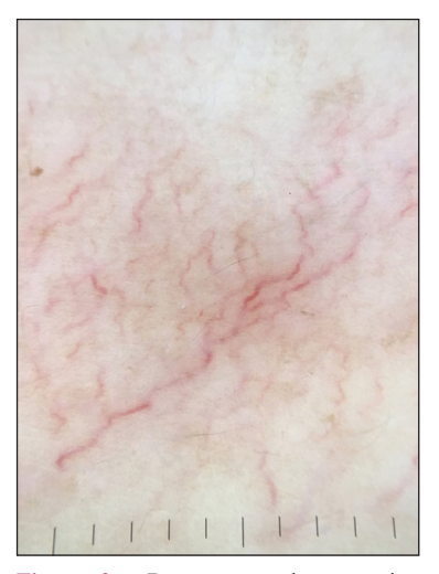
Figure 2a: Dermoscopy demonstrating erythematous-brownish background with prominent angioid streak pattern or linear-irregular branching vessels (polarising, original magnification x10).

Due to its benign nature and asymptomatic course, patients usually do not require treatment. For aesthetics, a pulsed dye laser could be chosen, considering its effect on telangiectasia. In conclusion, TMMA is not uncommon and probably unreported among Asian men. Dermoscopic features can be used to make the clinical diagnosis more accurate and avoid unnecessary skin biopsies.