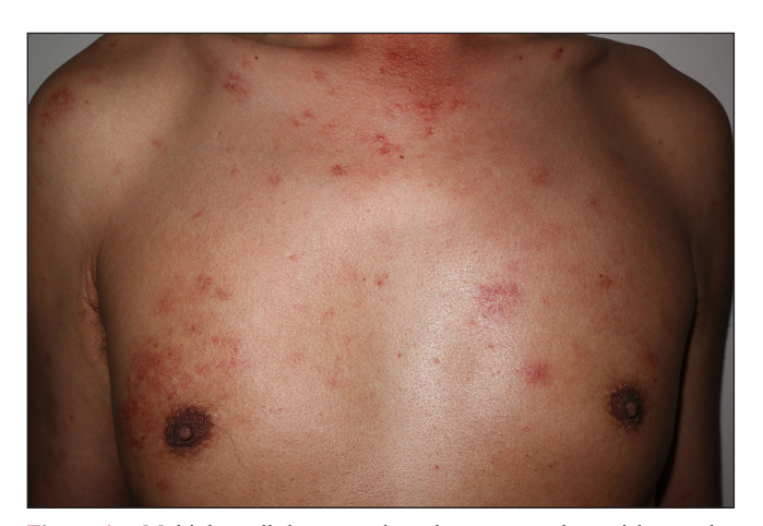
Figure 1a: Multiple well-demarcated erythematous to brownish macules with telangiectasia on the chest.

The aetiology of the TMMA is unknown. Vessel defects resulting from either a birth defect or ageing may play a role in pathogenesis. In addition, it has been inferred that abnormal oestrogen metabolism in liver disease especially as viral markers are positive may cause vascular changes.<sup>2</sup>