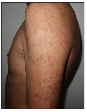
Figure 1b: Multiple well-demarcated erythematous to brownish macules with telangiectasia on bilateral upper limbs.

How to cite this article: Wang X. Dermoscopic features of telangiectasia macularis multiplex acquisita. Indian J Dermatol Venereol Leprol. 2025;91:S82-S84. doi: 10.25259/IJDVL 762 2023