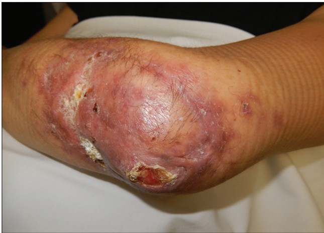
Figure 1a: At presentation, the patient showed an atrophic, infiltrated plaque with areas of hyperkeratosis and ulceration

diseases. Since then, there have been additional reports of necrobiosis lipoidica which developed at sites of previous trauma or surgery. Most of them were women, in a female-male ratio of 3:2 and the majority were located on the legs and abdomen, following vascular and abdominal surgery. 2-4 The interval between surgery/trauma and the appearance of the disease was variable from some months as in our case, to 38 years in one case. 4 Some of the patients had, in addition, other dermatological conditions such as psoriasis, morphea or silicotic granulomas. 3,4