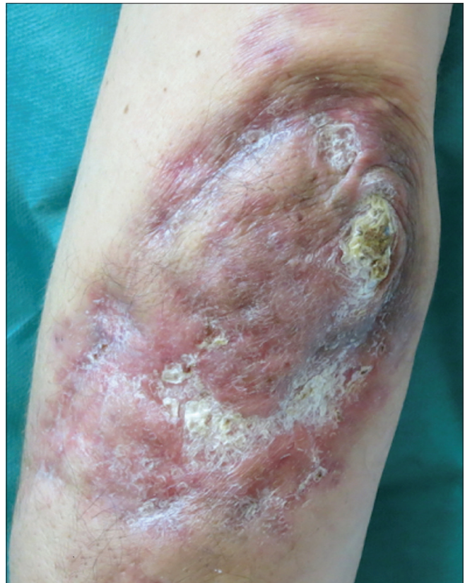
Figure 1b: One month after administration of cyclosporine, lesion is resolving with healing of the ulcerated areas

Another interesting point to note is that, of the ten cases we found in the literature, four had a previous history of necrobiosis lipoidica [Table 1], whereas in the other cases, including ours, this was the first manifestation of the disease. This made us wonder whether this was an isomorphic Koebner's phenomenon or Wolf's isotopic response, which is not previously described in