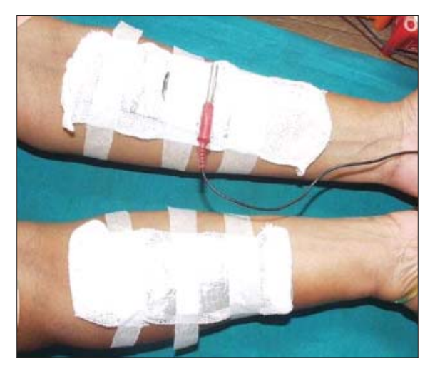
Figure 1: Iontophoretic delivery of dexamethasone

After one minute, the test site was wiped with filter paper to remove the excess histamine solution. The size of wheal was recorded in millimeters after 15 minutes. The mean size of wheal was calculated by