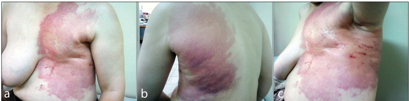
Figure 1: (a-c) Carcinoma erysipeloïdes caused by recurrent intraductal breast carcinoma. Erythematous plaque over the anterior chest wall extending to the back

The other distinctive clinical patterns of metastasis almost exclusive to breast cancer include telangiectatic carcinoma and carcinoma en cuirasse. Carcinoma telangiectoides is manifested by red papules