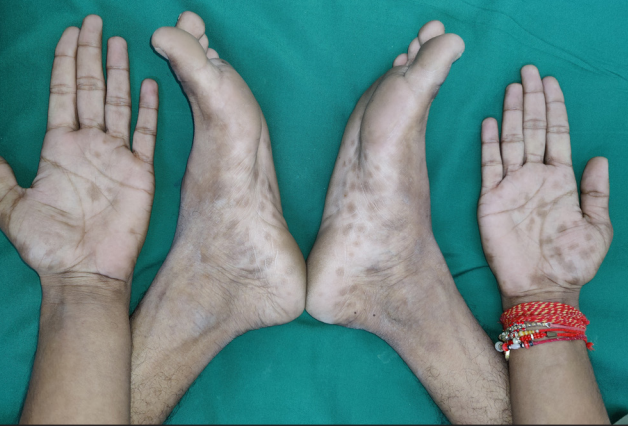
well- Figure 4b: Multiple brownish hyperpigmented macules and papules over Figure erythematous to brown the palms and soles in a patient with secondary syphilis.