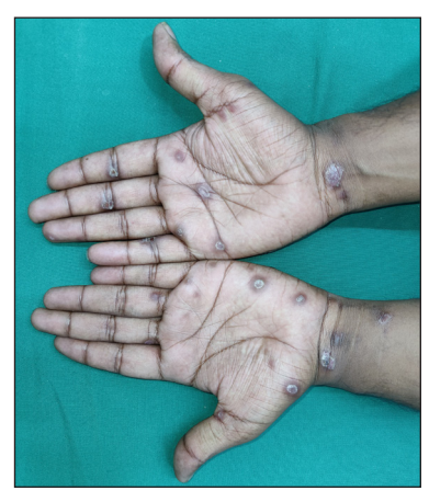
4c: Multiple well-defined psoriasiform plaques over the palms in a patient with secondary syphilis.