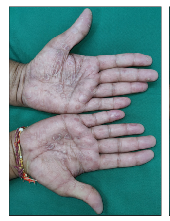
Multiple Figure defined papulosquamous plaques with Biett collarette over the palms and soles in a patient with secondary syphilis.