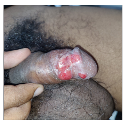
Figure 3b: Multiple well-defined ulcers over the glans penis and prepuce.