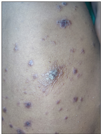
the trunk in a patient with secondary syphilis. plaques in a Corymbose arrangement over the trunk in a patient with secondary syphilis.