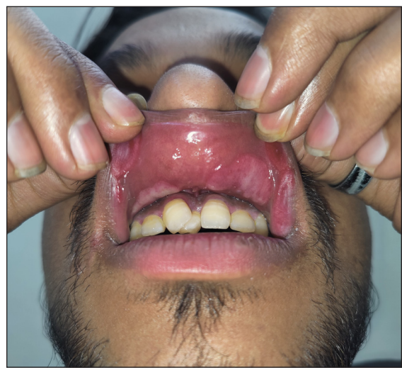
Figure 4d: Copper-coloured macules over Figure 4e: Multiple lichenoid papules and Figure 4f: Mucous patches in a patient with secondary syphilis.