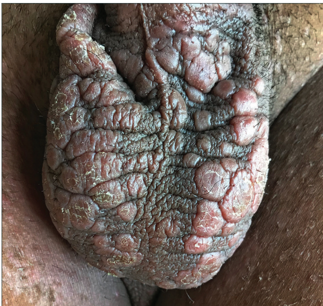
Figure 1a: Multiple erythematous, flat-topped, round to oval plaques over the scrotum

and systemic examination revealed no significant abnormalities. Cutaneous examination showed multiple, erythematous, flat-topped, round to oval, firm, non-tender plaques distributed over the scrotum [Figure 1a]. A few pigmented macules were seen over the soles [Figure 1b]. Mucosal examination revealed no abnormal findings. A skin