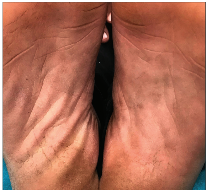
Figure 1b: A few pigmented macules over instep of soles

How to cite this article: Bains A, Tyagi N. Scrotal plaques as a predominant presentation in a case of secondary syphilis. Indian J Dermatol Venereol Leprol 2021;87:252-4.