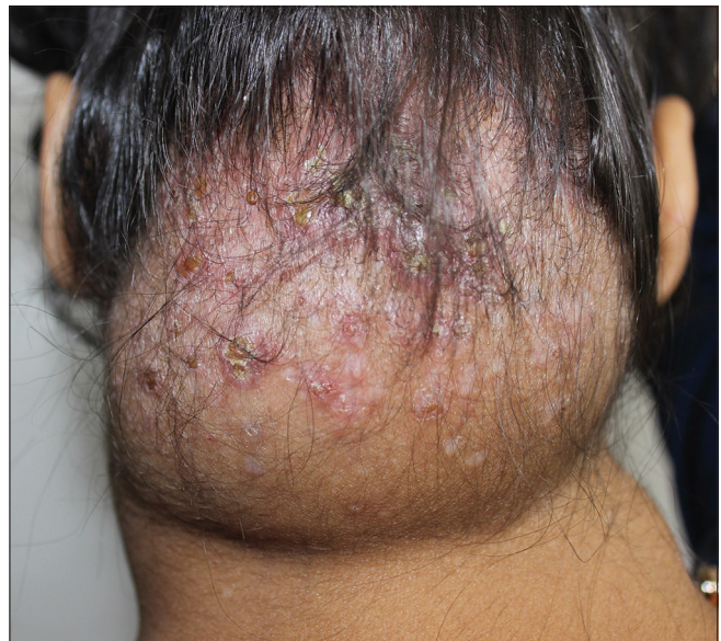
Figure 1: Soft swelling on nape of neck studded with erythematous papules, many of them covered with yellowish crust

Rosai–Dorfmann disease, tuberculosis and histoplasmosis. The lesion on trunk was subjected to histopathology. Fine-needle aspiration cytology was done from swelling on the neck. Dense infiltrate in papillary dermis comprising of Langerhans cells having eosinophilic cytoplasm with coffee bean nuclei having vesicular chromatin and prominent nucleoli was found on histopathology which were positive for CD1a on immunohistochemistry [Figures 4-6]. Fine-needle aspiration cytology also showed similar picture of Langerhans cells [Figure 7].