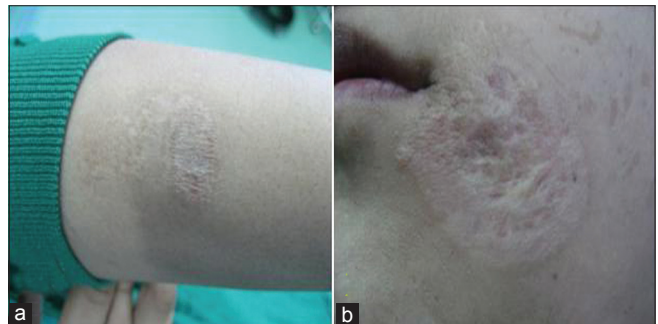
Figure 2: (a) Atrophic scar on the left forearm skin (b) Atrophic scar on the left oral commissure