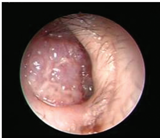
Figure 1: Endoscopy of the left nasal fossa showing an infiltrated erythematous nodule in the anterior part of the left septum

Full healing was achieved along with improvement of symptoms without any significant side effects. No recurrence has been observed after 1 year of follow-up.