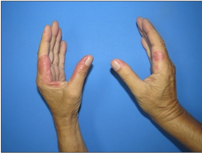
Figure 3: Improvement of neutrophilic dermatosis of dorsal hands after treatment.