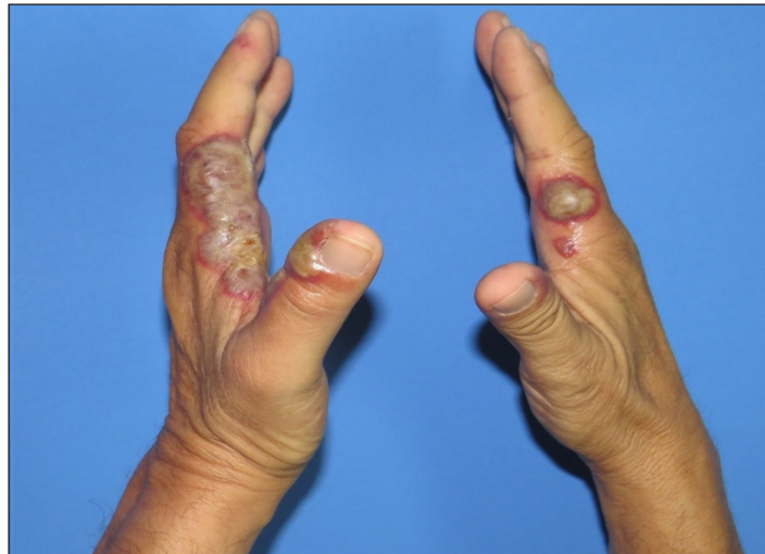
Figure 1: Symmetrical edematous violaceous plaques and bullae on both hands.