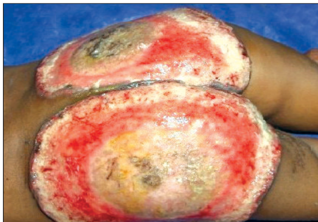
Figure 1: Bilateral gluteal ulcers with raised violaceous margins and central healing

the site of venipuncture suggesting that the pathergy test was positive. With daily wound dressings, injectable antibiotics oral hematinics and two units of blood transfusion, the slough decreased but the ulcer progressed. The left gluteal ulcer biopsy showed dense infiltration by neutrophils and lymphocytes [Figure 2] along with a leukocytoclastic response and evidence of vasculitis in the dermis. No granuloma, parasite or fungus was seen. The findings were consistent with pyoderma gangrenosum.