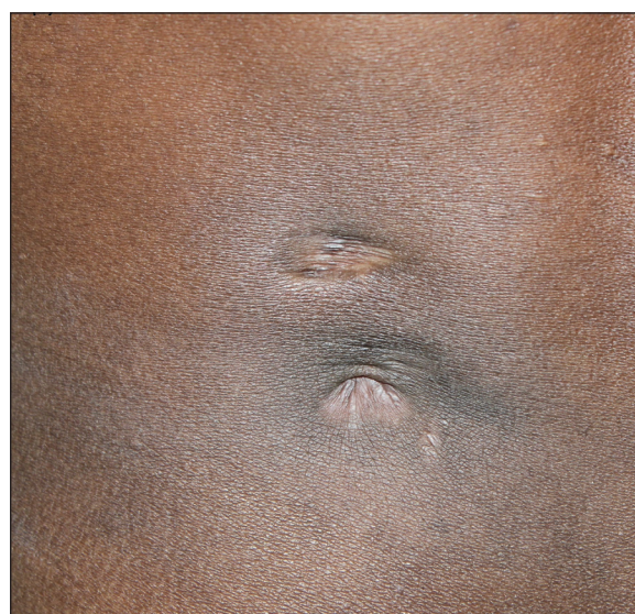
Figure 1b: Post-treatment healed sinus with puckering in the same patient.