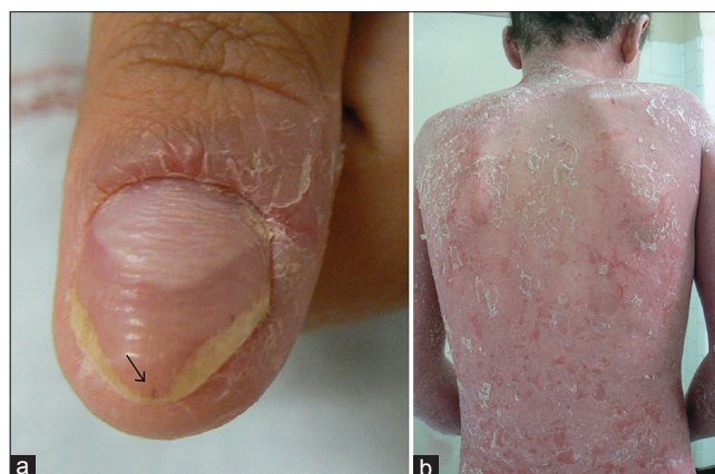
Figure 2: (a) Beau's lines, splinter hemorrhage (arrow), hyperkeratosis and periungual desquamation. (b) Clinical lesion of the patient with severe erythrodermic psoriasis