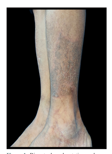
Figure 1: Discrete, hyperkeratotic papules on the left leg.

Physical examination showed a plaque composed of excoriated, firm, hyperpigmented, hyperkeratotic papules measuring 20 × 7 cm on the anterolateral aspect of the lower two-thirds of the left leg [Figure 1]. No other cutaneous or mucosal lesions were noted, and the patient was psychologically stable. There was no history of atopy. Routine laboratory investigations, including complete blood count, renal, hepatic, and thyroid function tests, and urinary analysis, were within normal limits. A punch biopsy revealed hyperkeratosis, hypergranulosis, irregular acanthosis, and basal hydropic degeneration in the epidermis. Additionally, small hyaline deposits of amyloid were identified in the papillary dermis [Figure 2], suggestive of lichen amyloidosis. Demonstration with special stains could not be undertaken.