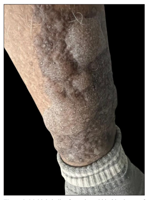
Figure 3: Multiple bullae formation within 20 minutes of cryotherpay.

In conclusion, cryotherapy may be an effective treatment for lichen amyloidosis that is resistant to other options, leading to significant clinical improvement and pruritus reduction, highlighting its potential in managing LA.