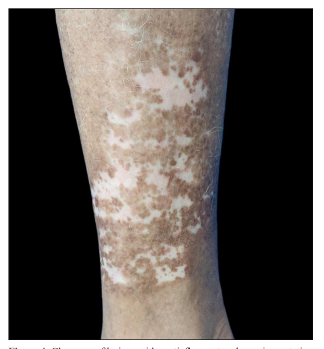
Figure 4: Clearance of lesions with postinflammatory hypopigmentation after 4 months of cryotherapy on left leg.