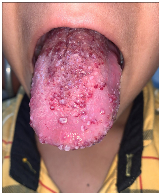
Figure 1: Diffuse infiltration of the tongue with multiple clear-fluid filled and haemorrhagic vesicles at baseline.

Lymphatic malformations (LM) are slow-flow congenital vascular anomalies. 1 Around 48% of lesions involve the head and neck. LMs in the neck can cause dysphagia and be life-threatening due to airway obstruction in cases of laryngo-bronchial microcystic LMs or circumferential subglottic LMs. 2 Current treatment options include medical therapy such as sildenafil, and propranolol along with surgical excision, sclerotherapy, radiofrequency ablation, and ablative lasers. Sclerotherapy is most commonly used in macrocystic malformations and is effective in almost 73–97% of cases. Skin necrosis, hematoma formation, infection, and scarring