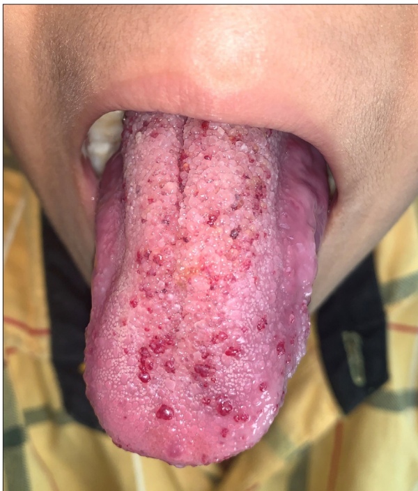
Figure 3a: 20–25% decrease in lesions after 2 months of oral sirolimus.