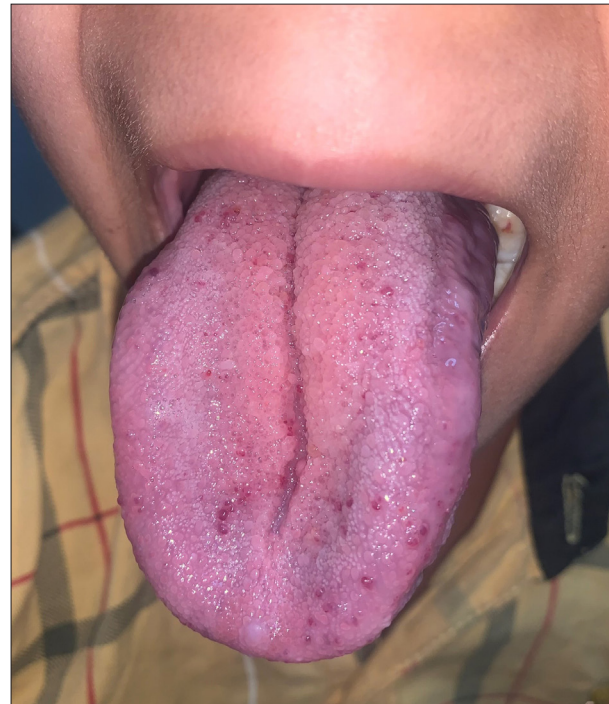
Figure 3b: 70–80% decrease in lesions after 9 months of oral sirolimus.

are the usual complications. Surgical excision, another option for macrocystic disease, is more extensive, and microcystic LMs are difficult to be excised completely and have a higher recurrence risk. Surface ablative measures like radiofrequency and carbon dioxide laser only provide