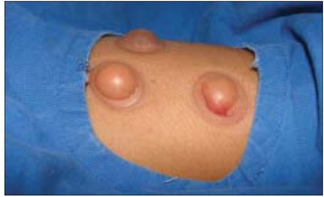
Figure 3: Blisters raised using the current method

Most modern dermatology centers have microdermabrasion units and the same can be effectively utilized to harvest suction blisters for stable vitiligo or postinflammatory depigmentation. The use of the microdermabrasion machine for the creation of suction blister is unlikely to affect the life of the machine in any way, because the total time per site for creating adequate suction is very minimal. (The machine needs to be switched on only for around thirty seconds per site, after which the suction can be locked). We could not think of any drawbacks of this method compared