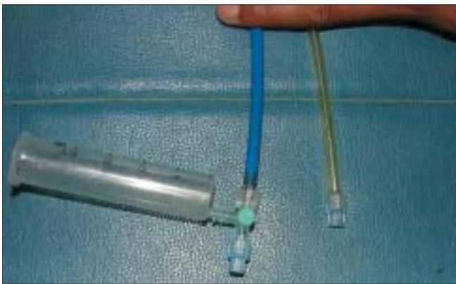
Figure 2: Occluding the non vacuum end and attaching 20 ml syringe to vacuum end

lock the suction and the blue tubing is gently removed so that the syringe stands independently due to the suction. Good blisters are obtained in an average period of two to three hours [Figure 3].