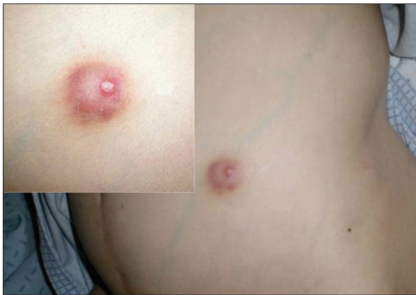
Figure 1: Skin lesion on the abdomen: erythematous subcutaneous nodule

The patient was diagnosed with cutaneous aspergillosis secondary to pulmonary aspergillosis. Insulin therapy was provided to achieve optimal glycemic control. She was started on therapy with liposomal amphotericin B (L AmB) at 5 mg/kg body weight/day intravenously while maintaining the immunosuppressive drugs. About 2 weeks later, following aggravation of the condition with the emergence of new skin lesions, L AmB and sirolimus were suspended, tacrolimus was reduced to 1.5 mg/day, and voriconazole (VOR) was started at 5 mg/kg body weight twice daily orally. Although a clinical improvement was observed almost immediately after 2 days of therapy, followed 7 days later by the regression of skin lesions, the patient died of an extensive acute ischemic cerebrovascular disease after 3 weeks of using VOR, which was confirmed by brain computed tomography.