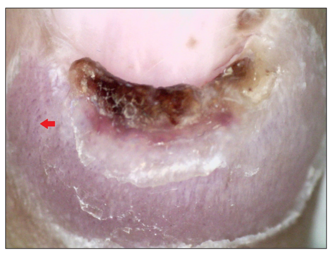
Figures 2b: Pre-treatment: Brown crusting, swelling and short linear vessels on proximal nail fold (PNF) (red arrow) and nail bed vascularity of left 5th digit. Dino-lite AM7115MZT, non-contact, polarised mode, 50x).