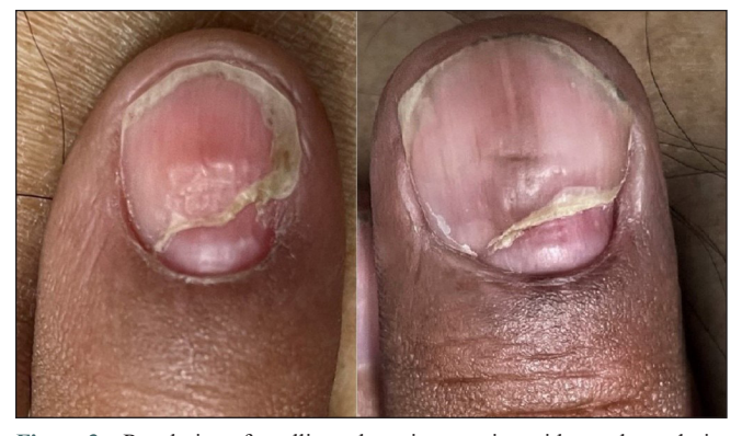
Figure 3c: Resolution of swelling, ulceration crusting with onychomadesis.

lesions with hyperpigmentation was observed [Figures 3a and 3b] along with reduction in periungual swelling and crusting [Figure 3c].