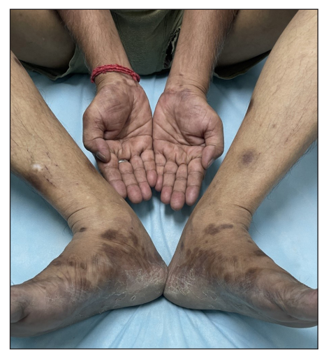
Figure 3a: Resolution of scaling and crusting on the feet and palms.