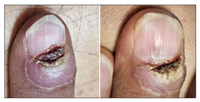
Figure 1c: Left hand's fifth digit shows crusted ulceration encroaching the nail bed and the right hand's third digit shows swelling with overlying crusted ulceration.