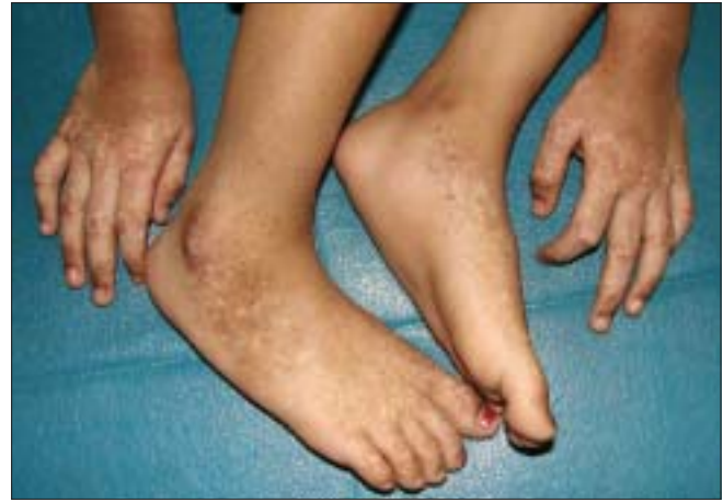
Figure 2: Acral dyschromatosis