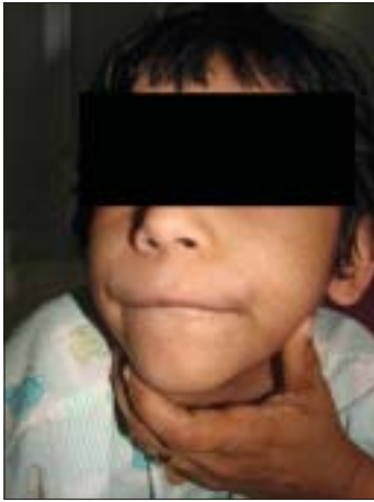
Figure 1: Hyper and hypo-pigmented lesions on the face