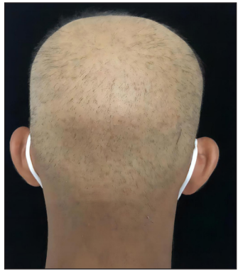
Figure 2i: Case 5 before treatment.