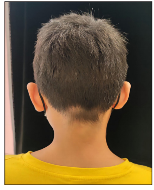
Figure 2b: After treatment of tofacitinib for 6 months, Case 1 showed rapid hair recovery and the SALT score decreased from 85 to 4.