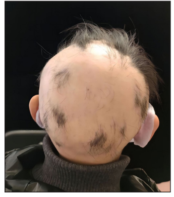
Figure 2a: Case 1 before treatment.