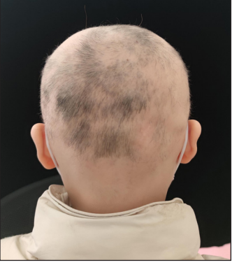
Figure 2c: Case 2 before treatment.