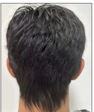
Figure 2j: Case 5 after treatment. He had a complete response after 15 months of baricitinib treatment.