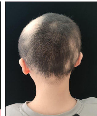
Figure 2d: Case 2, an 11-year-old girl, achieved obvious hair regrowth after 6 months of tofacitinib treatment, with an improvement in the SALT score from 88 to 55.