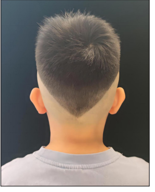
Figure 2f: After treatment of tofacitinib for 8 months, Case 3 showed significant hair recovery and the SALT score decreased from 100 to 10