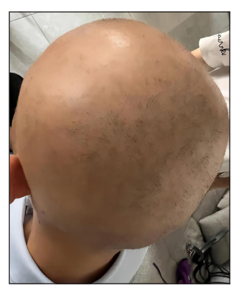
Figure 2g: Case 4 before treatment.