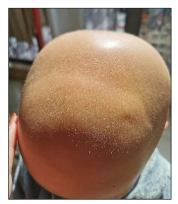
Figure 2e: Case 3 before treatment.