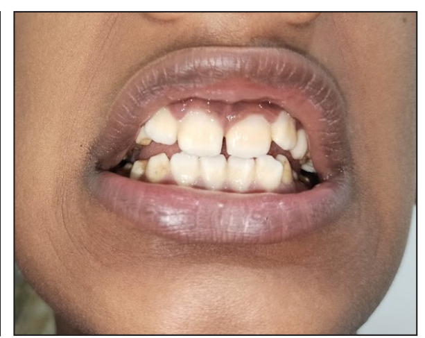
Figure 2: Dark-brown, adherent Figure 3: Hypoplastic dental enamel.

How to cite this article: Mathews J, Chandrasekaren A. Neonatal ichthyosis and sclerosing cholangitis (NISCH) syndrome with a novel Claudin-1 (CLDN1) mutation: A case report from India. Indian J Dermatol Venereol Leprol. 2025;91:89-91. doi: 10.25259/IJD-VL 186 2023.