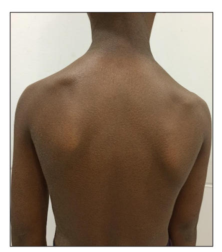
Figure 1: Diffuse scaling over the trunk and upper limbs. Large ears were also present.

Ultrasound examination of the abdomen showed course echotexture of the liver. Liver size, biliary radicals, the common bile duct and portal veins were normal. No leucocyte vacuoles were present in a peripheral smear examination. A skin biopsy revealed acanthosis, hyperkeratosis and mild hypogranulosis, but no keratinocyte vacuoles. Liver function tests, TSH and blood sugars were normal. Informed written consent was obtained from the father for genetic testing. An exome-sequencing (MedGenome Labs Ltd., Bangalore) revealed a homozygous single-base-pair deletion in Exon 1 of the CLDN1 gene (NM_021101.5:c.141del), causing a frameshift and premature truncation of the claudin-1 protein downstream to codon 47 (p.Tyr47Ter). The variant was detected at a sequencing depth of 122x and deletion of a guanidine nucleotide was seen in all reads at