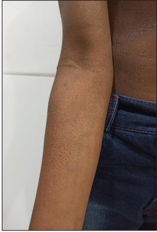
Figure 2: Dark-brown, adherent scales over the forearm with relative sparing of the cubital fossa.