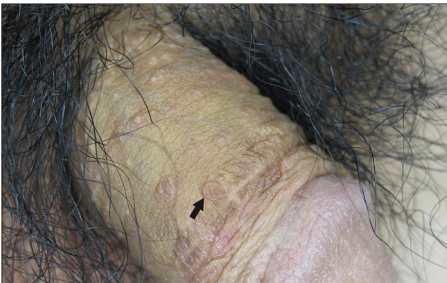
Figure 1: Multiple asymptomatic brown-yellow papules on the dorsal penile shaft