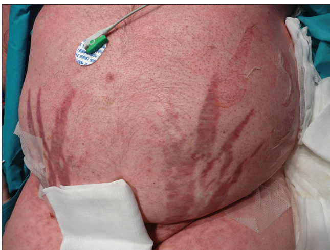
Figure 1c: Typical Cushing's stretch marks and epidermal detachment on the abdomen