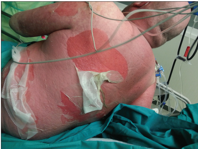
Figure 1a: Large areas of epidermal detachment on the posterior trunk and upper limbs

A consultation was requested to the clinical pharmacology department, who performed the ALDEN algorithm for drug causality. 4 The scores were: 4+ for ketoconazole and 3+ for oseltamivir, meropenem, teriparatide and spironolactone.