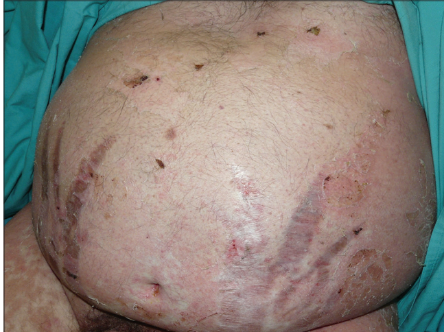
Figure 2: Clinical appearance of lesions 2 weeks after starting treatment with cyclosporine

A lymphocyte transformation test was performed a year after the resolution of toxic epidermal necrolysis in order to confirm drug causality. Positive results were obtained with oseltamivir (stimulation index >2.5 in two independent assays) but were negative with ketoconazole and meropenem [Table 2].