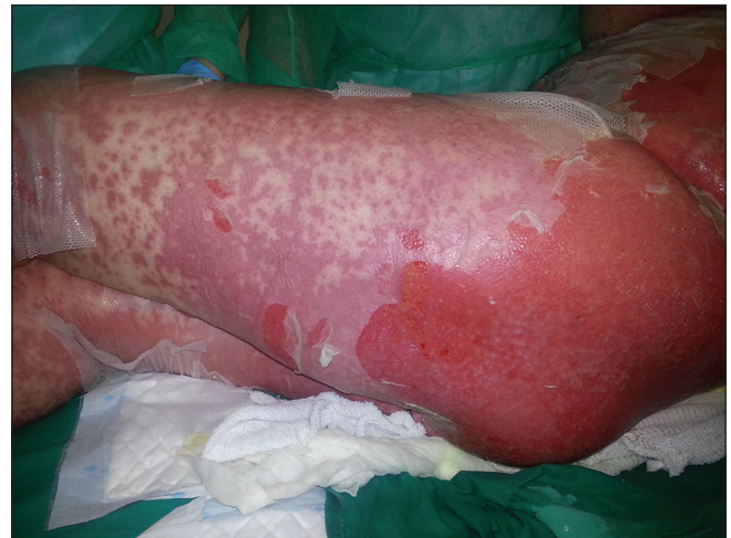
Figure 1b: Large areas of epidermal detachment on the buttocks and lower limbs