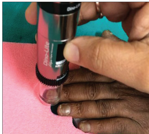
Figure 1: Onychoscopy of an adult case using a foam piece as a cushion at the distal end

Departments of Dermatology and 1 General Medicine, Maharishi Markandeshwar Institute of Medical Sciences & Research, Maharishi