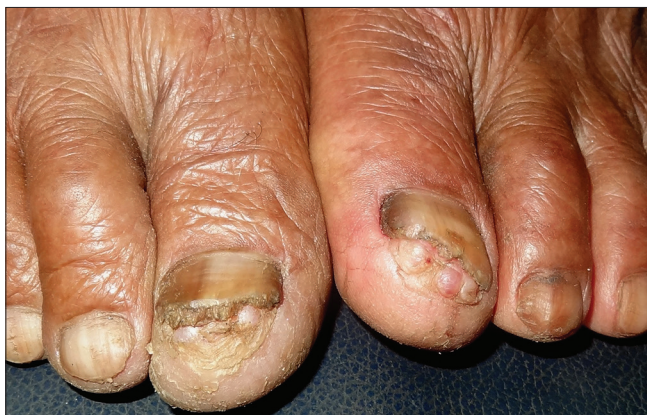
Figure 1: Multiple subungual inclusions cysts present under the distal end of the nail plates of both big toes

A 68-year old farmer presented with multiple soft masses under the nails of both big toes of approximately 10 years duration. There was intermittent purulent discharge from the lesions associated with pain that used to resolve with systemic antibiotic therapy and rest. However, this was not followed by any diminution in the size of the lesions. The frequency of such episodes was 3–4 times a year and no inciting factors could be identified on history. Other toenails or fingernails were unaffected. He gave a history of working bare-feet and kneeling often in the fields. Examination revealed multiple bilateral soft, cyst-like nodules under the distal free edge of both big toes' nails [Figure 1]. In addition, onycholysis, subungual hyperkeratosis and yellowish discoloration of nail plates were observed. X-rays of the feet did not reveal any abnormality. Excision biopsy from one of the lesions revealed bulbous elongation of the rete ridges with cyst formation that contained compact keratin. The granular layer was absent in the cyst wall [Figure 2]. These findings were consistent with clinical diagnosis of subungual epidermoid inclusions. Punch excision of the lesions in multiple sessions was planned. However, after the first session, the patient was lost to follow-up.