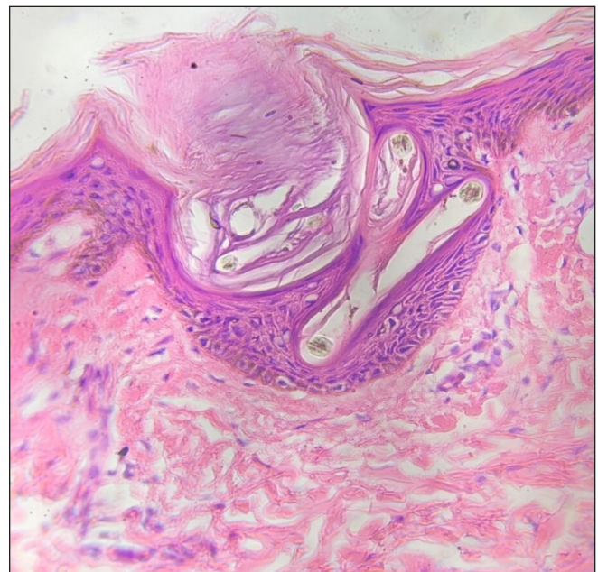
Figure 3b: Histopathology showing follicular plugging and corkscrew hair in epidermis (40x H&E stain)