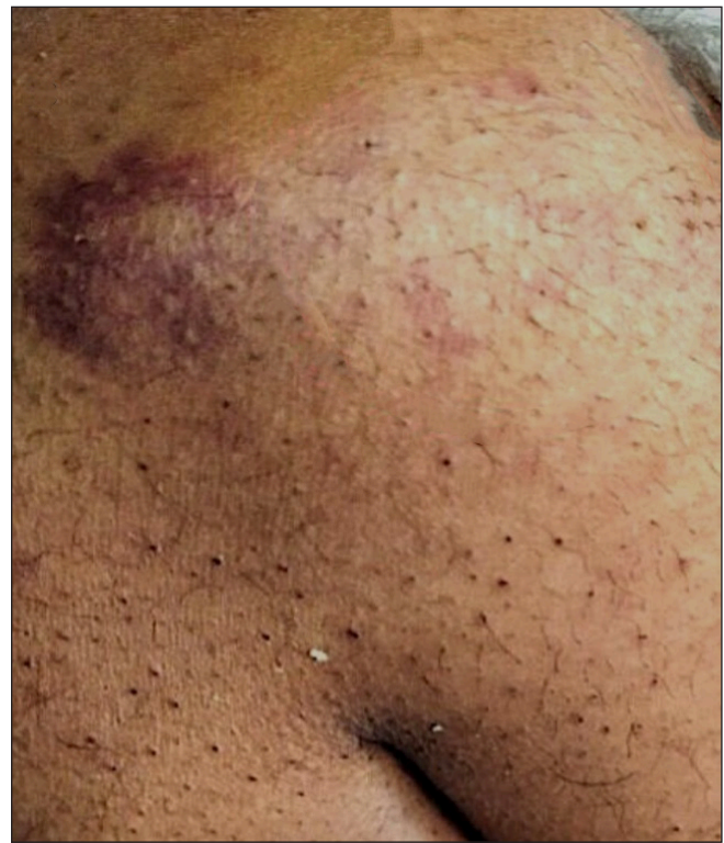
Figure 1b: Xerosis with keratotic plugs over the knee joint

How to cite this article: Dhurat RS, Sharma R, Pai SU, Zatakia SM. Scurvy-Once a common condition likely to be missed in these uncommon times! Indian J Dermatol Venereol Leprol doi: 10.25259/IJDVL_400_2023