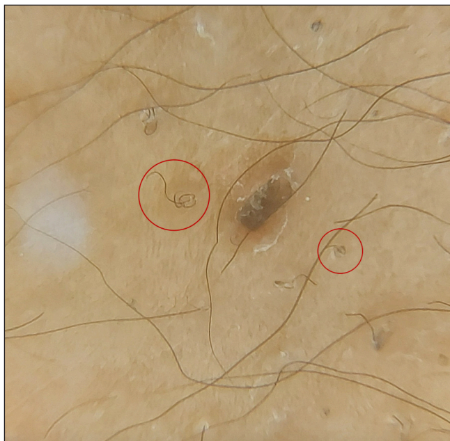
Figure 3a: Dermoscopy showing coiled hair

Scurvy is a multiorgan systemic disease because of diverse functions of vitamin C. The occurrence of scurvy in children with autism or other neuropsychiatric disorders is not uncommon. 1 Additionally, the high-risk groups include children with iron load due to multiple blood transfusions, anorexia nervosa, celiac disease, Crohn's disease, haemodialysis and other causes of a restricted diet. 1 A few dermatological signs, which are seen in the early stages, are follicular hyperkeratosis and coiled corkscrew hair. 2 Broken and lustreless hair are due to abnormal disulfide bonding and keratin formation. 3 Fragile blood vessels resulting from impaired collagen synthesis give rise to perifollicular haemorrhages, petechiae and ecchymoses. 2 Rarely, we may see nail splinter haemorrhages and alopecia. 3 Serum vitamin C levels are considered specific, but laboratory tests are