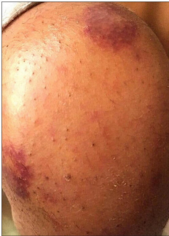
Figure 1a: Ecchymosis over knee joint

ecchymotic patches. Treatment with systemic antibiotics, anticonvulsants, muscle relaxants and multivitamins were initiated by the paediatrician and he was referred to the dermatology department for ecchymotic patches. He was poorly built, lethargic with delayed milestones and spasticity in all four limbs. He had pallor and painful edema of the knee joints. Cutaneous examination revealed multiple ecchymotic patches over the knee joints and a few follicular and non-follicular palpable purpura on the lower limbs [Figure 1a]. We also noted sparse follicular keratotic papules and xerosis of the upper and lower limbs [Figure 1b]. We considered Henoch-Schönlein purpura and meningococemia as differentials. Investigations revealed haemoglobin of