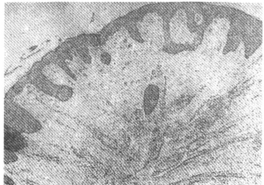
Fig. 2. Histopathology (low power).

not be present due to moist condition around rectal skin. Because of the absence of neural elements neurofibroma could be easily ruled out. Proctoscopy and sigmoidoscopy ruled out haemorrhoids and papilloma in the sigmoid colon and rectum. Local venous congestion or lymphatic stasis may contribute to this new feature of skin. This is being reported second