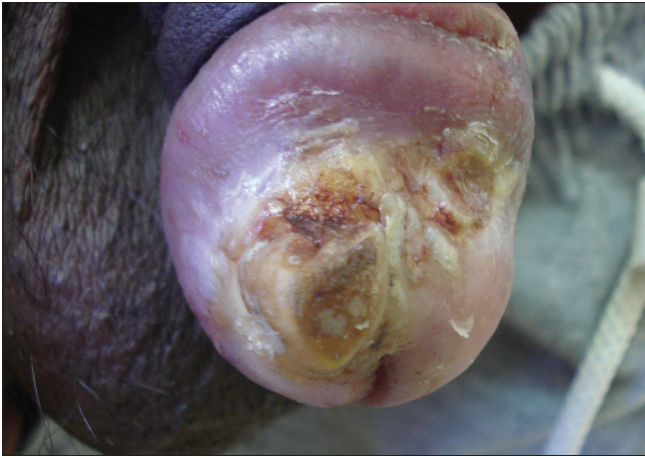
Figure 1: Central cutaneous horn surrounded by crusts and scaling at the margins