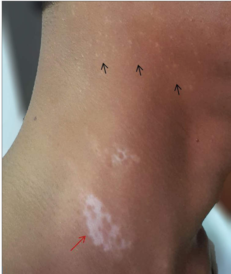
Figure 1: Patient with vitiligo (red arrow) showing multiple hypopigmented to depigmented macules (black arrows) on the neck

A 28-year-old man, undergoing treatment for vitiligo, presented with complaints of new lesions on the neck for the last 1 week. On examination, multiple hypopigmented macules were seen on the neck [Figure 1]. “Scratch sign” or “coup d’angle sign” was negative on examination with naked eye. On examination with a dermoscope (DermLite dl3 dermoscope, noncontact, polarizing, 10× magnification), very fine scales were present along the natural skin creases on a background of hypopigmented skin. Scaling was inconspicuous on the area between the skin creases. On stretching the skin these fine scales appeared more prominent under dermoscope but were still inconspicuous with naked eye [Figure 2]. Potassium hydroxide (KOH) mount confirmed the diagnosis of pityriasis versicolor.