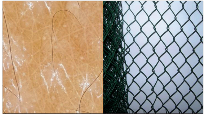
Figure 3: Magnified dermoscopic picture showing scales arranged along diamond-shaped skin markings giving a "wire fence" or "fish net appearance"

The dermoscopic feature of presence of fine scaling along the normal skin markings on a background of hypopigmented/hyperpigmented skin, giving it a "wire fence" appearance, may serve as a useful clue for easy and quick diagnosis of pityriasis versicolor [Figure 3].