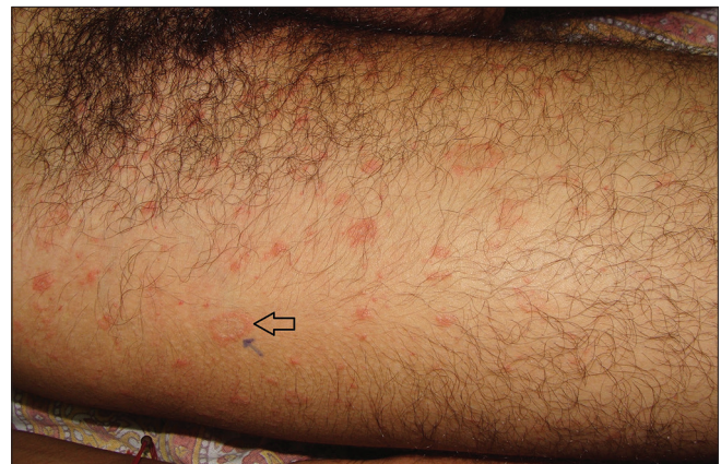
Figure 1a: Collarette scaling in the first, large lesion, the herald plaque (black arrow) on the upper part of right thigh

Blaschko-linear distribution in different diseases is hypothesized to be due to unmasking of tolerance or susceptibility of keratinocytes to the underlying disease. A group or a segment of mutated keratinocytes