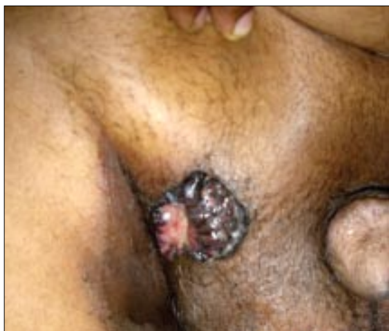
Figure 1: Ulcerated, pigmented growth on the scrotum