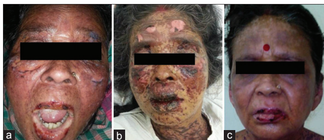
Figure 1: (a) Erythema over face with blistering and mucosal involvement. (b) Thirty-six hours after tacrolimus initiation. (c) On day 9, prior to discharge from hospital

disease behavior and its response to tacrolimus is depicted in Figure 2.