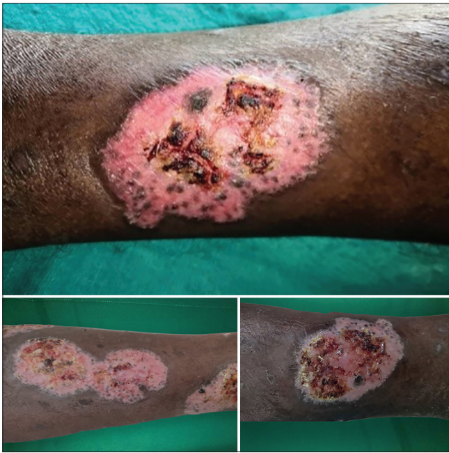
Figure 3: Lesions after 15 days of admission

this may be due to inadequate dosage of the antiviral drugs initially administered, and improper hygiene. He was treated successfully with parenteral antibiotics and antiviral therapy, initiated from the day of admission along with close monitoring of clinical signs, fluid resuscitation, adequate nutrition and debridement. Based on available reports, initiation of acyclovir within 24 h after the onset of rash has shown to reduce morbidity and mortality. 8 The latest WHO guidelines propose the use of intravenous acyclovir in patients with varicella who are immunocompromised or have severe complications. 9 In such cases, intravenous acyclovir followed by oral antivirals should be the treatment regime followed. 10