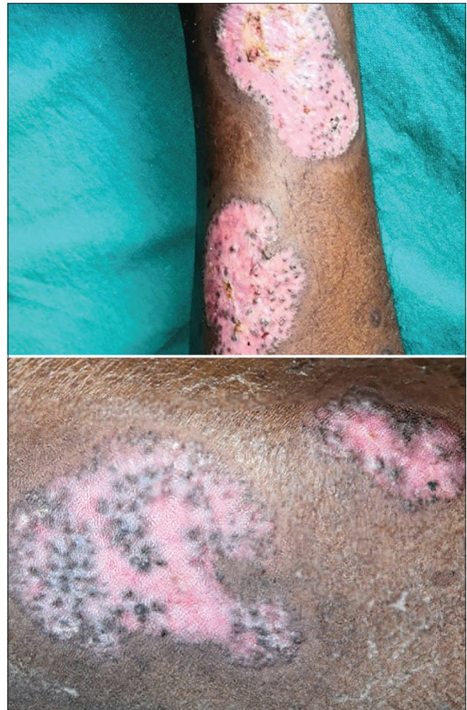
Figure 4: Lesions at discharge of the patient