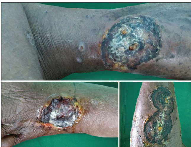
Figure 1: Lesions at the time of admission

Our patient presented with moderately severe lesions of moist gangrene. Since the patient was not immunodeficient,