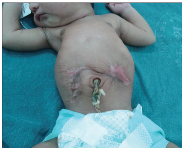
Figure 1: Bilaterally symmetrical arcuate, atrophic scars on the abdomen of a 1-day-old male baby

trauma, maternal infections or drug intake during pregnancy. An ultrasound study done at 7 weeks of pregnancy showed a viable twin intrauterine gestation that was monochorionic and monoamniotic [Figure 2a]. The second study at 23 weeks showed a single intrauterine gestation with a live fetus [Figure 2b] and the other twin was seen in the lower pole of the uterus as fetus papyraceus [Figure 2c]. The last study at 33 weeks showed only one viable fetus with the other fetus totally resorbed [Figure 2d]. The surviving baby was delivered by an emergency cesarean section 2 weeks before the expected date of confinement due to premature rupture of membranes and fetal distress. Macroscopic examination of the placental surface had showed no abnormalities. A skin biopsy was not performed as the mother did not consent to the procedure. Ultrasound study of the neonate's abdomen was unremarkable.