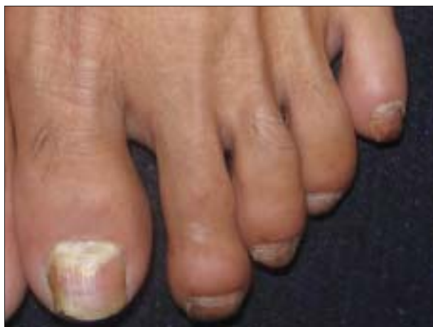
Figure 1: Proximal subungual onychomycosis involving the left great toe in a human immunodeficiency virus-positive patient