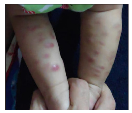
Figure 2b: Multiple well-defined tender subcutaneous nodules over bilateral lower legs.

BCGosis is a rare complication of BCG vaccination, observed in patients with underlying primary immunodeficiency disease. The European Society for Immunodeficiency (ESID), 2019, has categorised and defined the diagnostic criteria for BCGosis [Table 1]. Ong et al. observed skin and lungs involvement in 60% and 30% cases of BCGosis, respectively.<sup>2</sup> Cutaneous involvement presents as erythema, oedema, pustulation or abscess formation at the BCG injection site <sup>3</sup> or as disseminated lesions as cutaneous infection, maculopapular rash or regional lymphadenitis.<sup>2</sup> Pulmonary involvement may present as pneumonic infiltrates