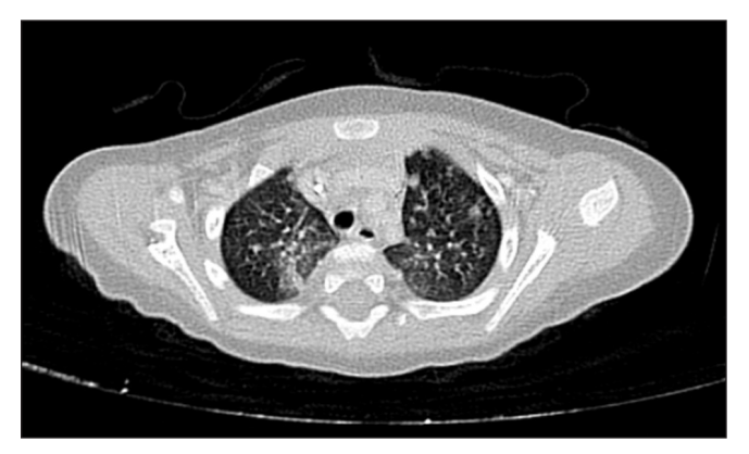
Figure 3: Axial Non-contrast computed tomography (NCCT) chest image of lower segment of right lobe showing subpleural cavitation.

neutrophilic and lymphocytic infiltrate [Figure 4]. Acid fast bacilli and Periodic acid Schiff (PAS) stains were negative. Tissue culture and polymerase chain reaction (PCR) for Mycobacterium bovis ( M.bovis ) were negative. Based on the above clinical findings and histopathological examination, the final diagnosis of BCGosis with erythema nodosum in a patient with chronic granulomatous disease was considered and first line ATT was started empirically. The fever subsided and lesions of erythema nodosum healed with residual hyperpigmentation after 4-weeks of starting ATT [Figure 5]. In addition, there was resolution of the BCG site abscess.