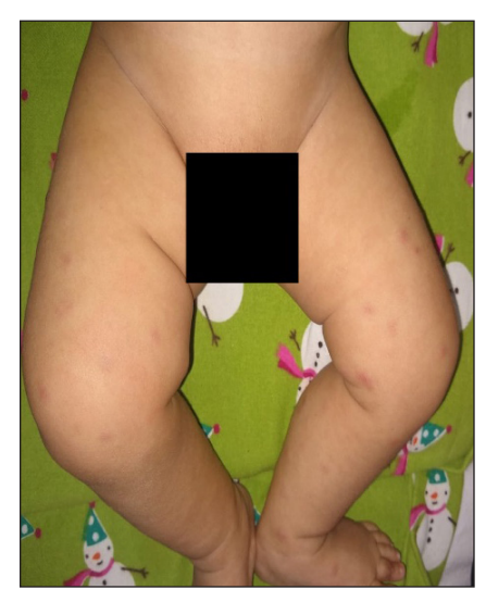
Figure 5: Day 15 of Antitubercular therapy (ATT): Significant improvement in the erythema and oedema of the lesions in the lower limbs.