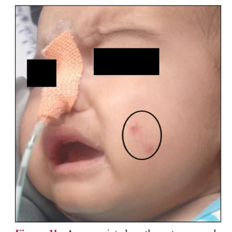
Figure 1b: An excoriated erythematous papule (black circle) over cheek with overlying punctum.

How to cite this article: Sahoo B, Monalisa K, Jhamb U, Saxena R. BCGosis with erythema nodosum in a child with chronic granulomatous disease: An atypical presentation. Indian J Dermatol Venereol Leprol. doi: 10.25259/IJDVL 384 2023