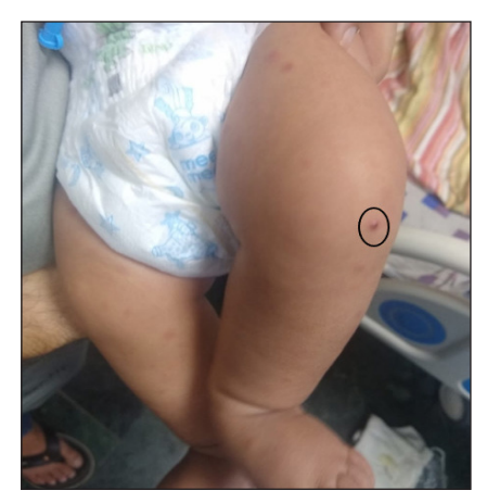
Figure 1a: Multiple erythematous shiny papules (black circle) symmetrically present over bilateral lower limbs

with a punctum [Figures 1a-1b]. Based on the clinical morphology, a provisional diagnosis of 'papular urticaria' was considered. However, the lesions increased in number, size and progressed to form tender subcutaneous nodules, in a period of 2–3 days [Figures 2a–2b]. On further enquiry, it was noted that there were two episodes of inflammation at the BCG site, 2 and 6 weeks prior to the onset of these lesions. Patient was admitted in the paediatric ward and was on multiple antibiotics (inj. linezolid, meropenem, ceftazidime, vancomycin, metronidazole), antifungals (liposomal amphotericin B) and systemic steroids for fever of unknown origin, and not responding. Chest X-ray revealed multiple fibro-nodular opacities and pleural effusion in bilateral lung fields. Computed tomography (CT) chest confirmed the presence of multiple nodules in both the lungs with cavitation in one of the subpleural nodules of the right middle lobe [Figure 3]. Sputum and gastric aspirate for acid fast bacilli (AFB) were negative. Ultrasound of the left upper arm revealed a well-defined hypoechoic lesion with a few internal echoes in the intramuscular plane at the site of BCG vaccination suggestive of 'Post BCG abscess formation'. Haematoxylin and Eosin stained sections from one of the subcutaneous nodules revealed mixed focal panniculitis with