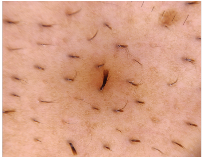
Figure 2: Trichoscopy (Illuco IDS-1100, Korea; \times 10 , polarized mode) revealing multiple short terminal hair emerging from a single hair canal

A 42-year-old male presented with complaints of persistent itching over back, of 3 years duration. Examination revealed an area of thick, short, prominent terminal hair over the interscapular region [Figure 1]. Trichoscopy revealed multiple easily extractable short hair of different lengths, emerging from a single hair canal, and enclosed in a common outer sheath [Figure 2]. Histological examination showed multiple hair shafts emerging from a single infundibulum, enclosed in a common outer root sheath and separated from each other by layers of inner root sheath. A diagnosis of pili multigemini was made. Treatment options include laser hair removal and electrolysis.