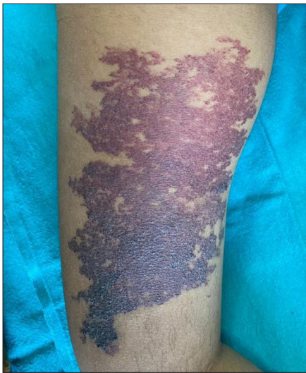
Figure 1: Capillary malformation over right overgrowth arm.

Video 1: "Demonstration of intralesional 3% polidocanol".