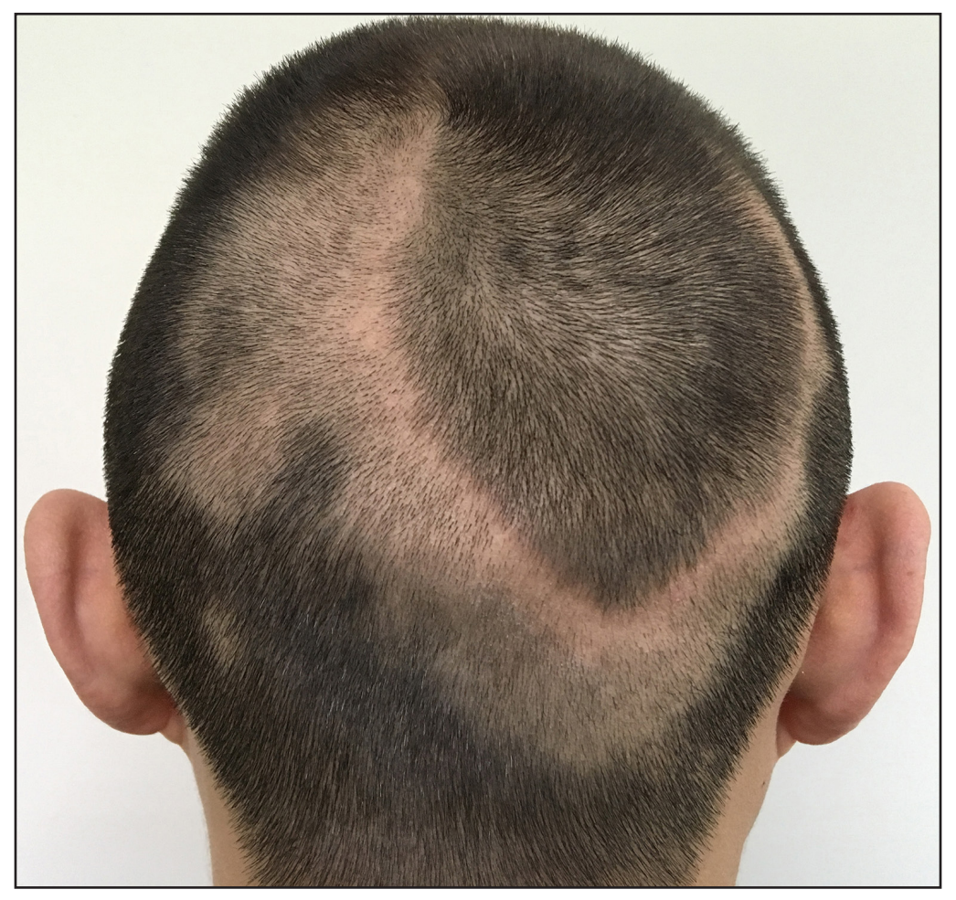
Figure 1: Annular alopecia and mild erythema on the scalp.

of the alopecic patch. Histopathology showed moderate lymphocytic infiltration, mainly in the deep dermis and subcutis, with hyaline fat necrosis [Figure 3]. Linear and annular lupus panniculitis of the scalp was diagnosed based on the clinicopathological features. Complete hair regrowth was achieved after glucocorticoid and hydroxychloroquine treatment.