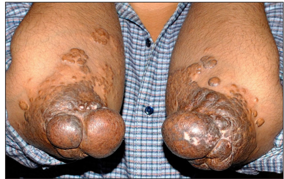
Figure 1b: Tendon xanthomas over the elbows.