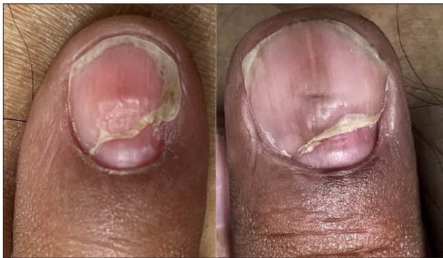
Figure 3c: Resolution of swelling, ulceration crusting with onychomadesis

lesions with hyperpigmentation was observed [Figures 3a and 3b] along with reduction in periungual swelling and crusting [Figure 3c].