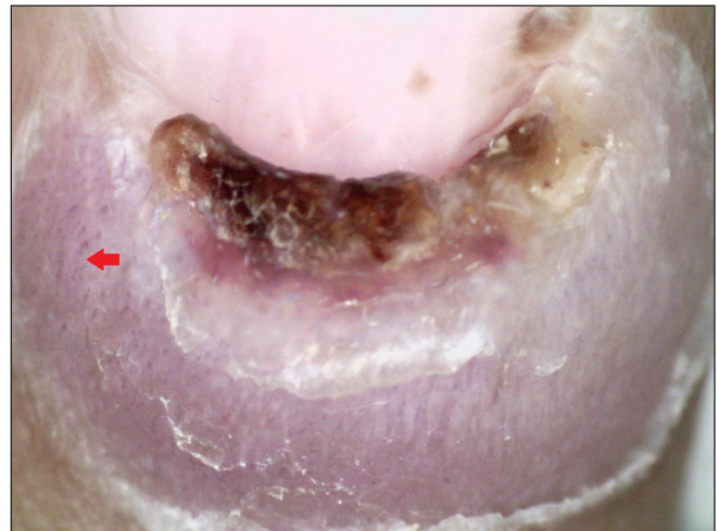
Figures 2b: Pre-treatment: Brown crusting, swelling and short linear vessels on proximal nail fold (PNF) (red arrow) and nail bed vascularity of left 5th digit. Dino-lite AM7115MZT, non-contact, polarised mode, 50x).