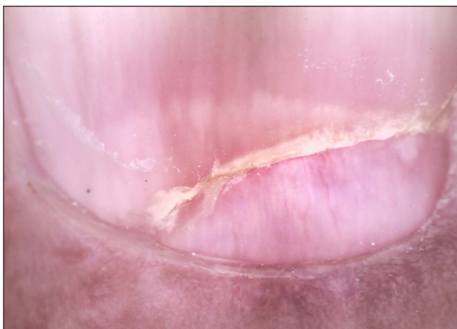
Figures 2c: Post treatment: Onychomadesis with proximal nail fold devoid of any lesion on right 3rd digit (Dino-lite AM7115MZT, non-contact, polarised mode, 50x).