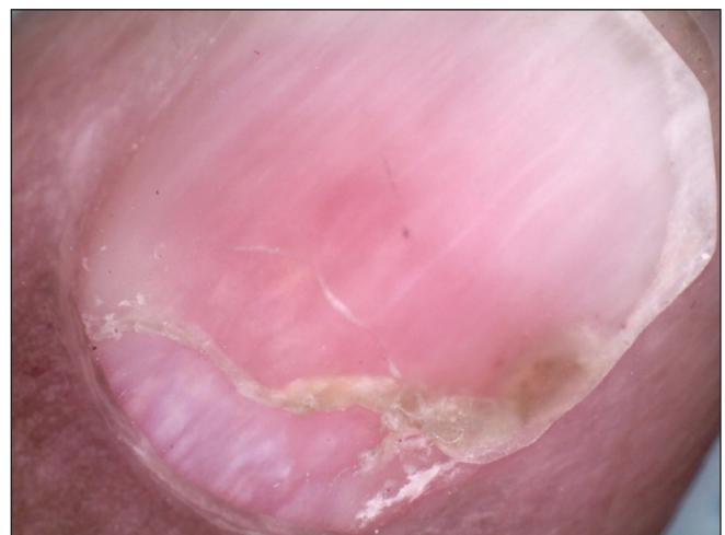
Figures 2d: Post treatment: Onychomadesis with normal proximal nail fold of left 5th digit (Dino-lite AM7115MZT, non-contact, polarised mode, 50x).

hemagglutination assay (TPHA) yielded a positive result. Routine haematological and biochemical investigations were normal and viral serologies (HIV, Hepatitis B & C) were negative. A diagnosis of secondary syphilis was made and