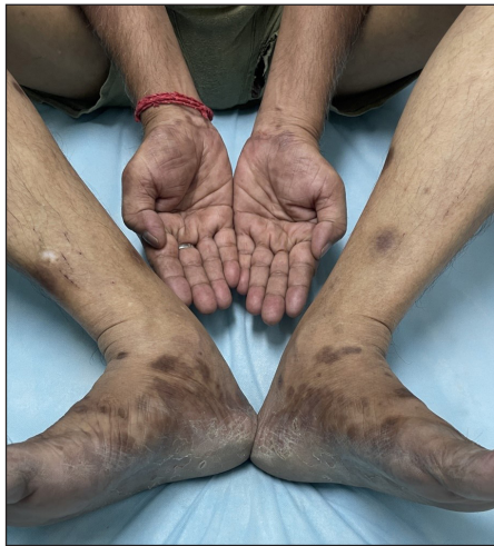
Figure 3a: Resolution of scaling and crusting on the feet and palms.