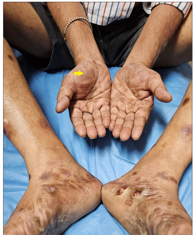
Figure 1a: Hyperpigmented plaques over the bilateral palms and soles, Bielt's sign positive (yellow arrow).

with brown crusting and white-yellow areas with peripheral white scaling was noted. In addition, increased vascularity of the nail bed [Figure 2 a] and short linear vessels on the proximal nail fold [Figures 2a and 2b] was noted and, after treatment marked improvement was observed with residual linear vessels in the nail bed and onychomadesis as a manifestation of prolonged nail matrix insult [Figures 2c and 2d]. Histopathological evaluation of the nail lesions was not done. Dark ground microscopy yielded positive results from the perianal lesion but negative from the periungual lesions. The Venereal Disease Research Laboratory (VDRL) test showed a reactive titre of 1:32, and the Treponema pallidum