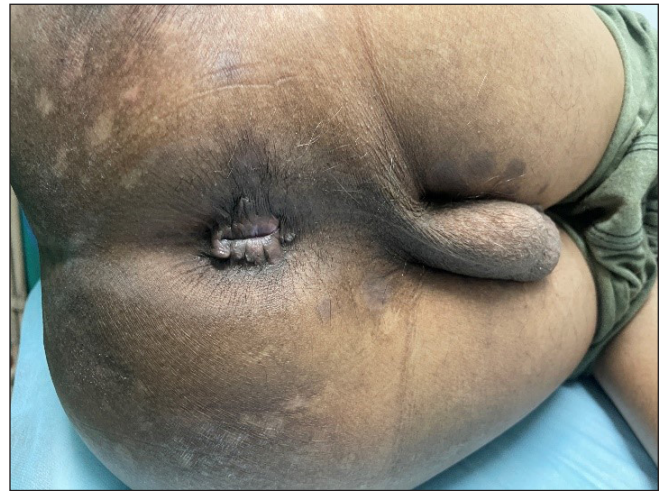
Figure 3b: Resolution of perianal lesion with hyperpigmentation.