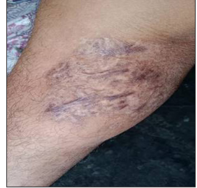
Disseminated Cutaneous Leishmaniasis - 3 years post-treatment complete re-epithelialisation.

patients, where a high plasma cell density distributed diffusely and ill-formed granulomas should alert one to the possibility of CL.23