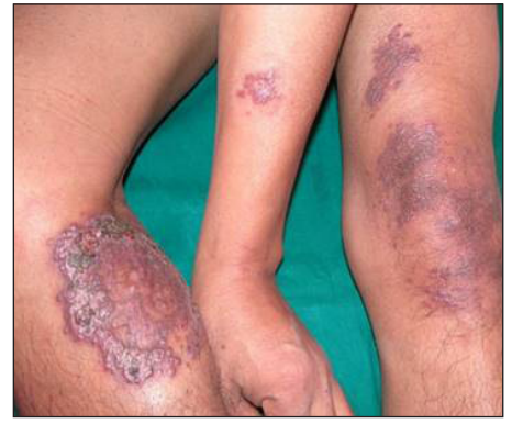
Figure 3a: Disseminated Cutaneous Leishmaniasis – Figure 3b: Disseminated Cutaneous Leishmaniasis – One Figure 3c: Pre-treatment.