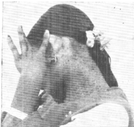
Fig. 2 Darier's disease. The lesions are seen over the retroauricular areas and side of the neck.