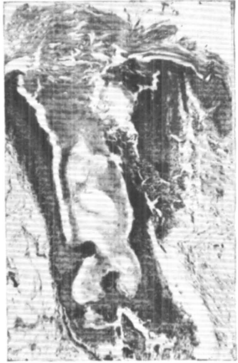
Fig. 3 Histology of Darier's disease showing hyperkeratosis, follicular plugging, acanthosis, suprabasal splitting and multiple corps ronds and grains.