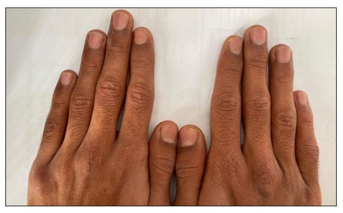
Figure 3: Resolution of nail changes observed during follow-up

nails in chronic renal failure is an increase in the stimulation of melanocytes by uremic substances, which promotes the production of melanin in the distal half of the nail.<sup>2</sup> In our case, the acute appearance of this sign in a healthy patient can be explained by the acral inflammatory process that causes vessel dilatation, which may induce a transient matrix injury; an increase in capillary density, and thickening of the capillary wall.<sup>5</sup>