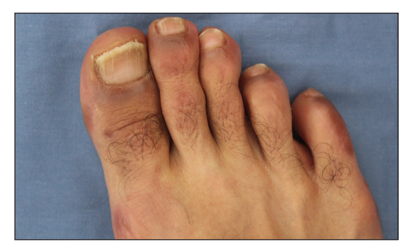
Figure 1c: Half and Half nails. Distal red part of the toenails.