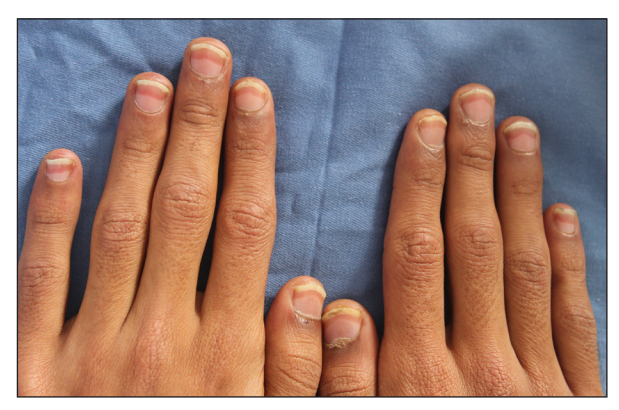
Figure 1b: Half-and-Half nails. The distal red part of the fingernails.

period. There was a history of labial herpes four days before. Clinical examination revealed symmetrically distributed, distinct targetoid lesions on the hands and feet [Figure 1a]. The examination of the mucous membranes showed no abnormalities. All the nails were affected; each with two parts: a proximal white and a distal red, occupying approximately 40% of the nail bed with a clear line of demarcation between them [Figures 1b and 1c]. These lesions did not disappear under pressure. There were no renal or hepatic abnormalities. The COVID-19 polymerase chain reaction (PCR), and mycoplasma and HIV serologies were negative. A skin biopsy showed keratinocyte necrosis, mild superficial dermal edema, and a lymphocytic infiltrate with exocytosis in the epidermis [Figure 2]. He was diagnosed as having half-andhalf nails associated with erythema multiforme and treated