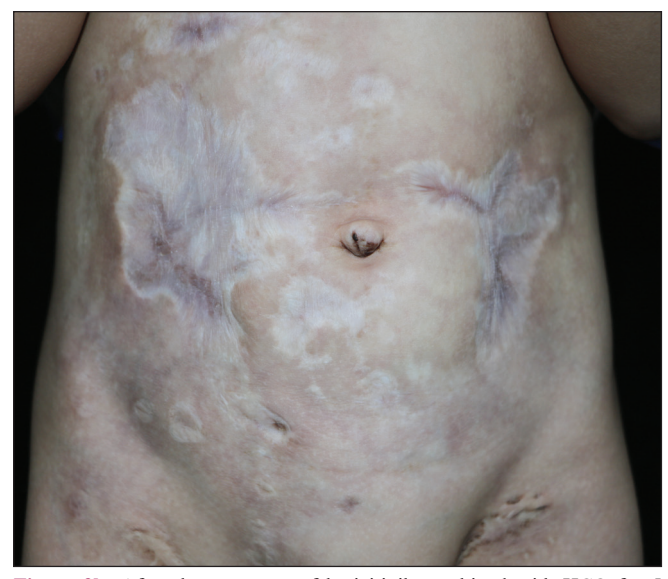
Figure 3b: After the treatment of baricitinib combined with HCQ for 5 months.