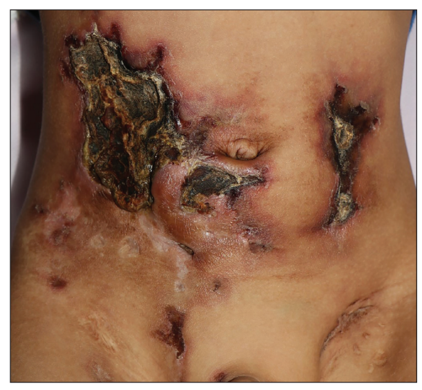
Figure 1: Giant ulceration with thick crust on the abdomen and inguinal region surrounded with infiltrated erythema.

The patient failed to respond to the treatment of antimicrobials and antifungal agents. A biopsy from the erythematous area was performed that showed small amounts of adipocytes with an inflammatory infiltrate of lymphocytes, histiocytes, and a few plasmacytes [Figures 2a and 2b]. LCAI was diagnosed. He was treated with Hydroxychloroquine (HCQ) at a dosage of 5.5 mg/(kg.d). After 4 months, the lesion had a significant improvement with rapid healing of the ulcer and necrotic crusts falling off. However, there was still an erythematous change at the border occasionally [Figure 3a]. Baricitinib was started at a dosage of 1 mg/day after obtaining informed