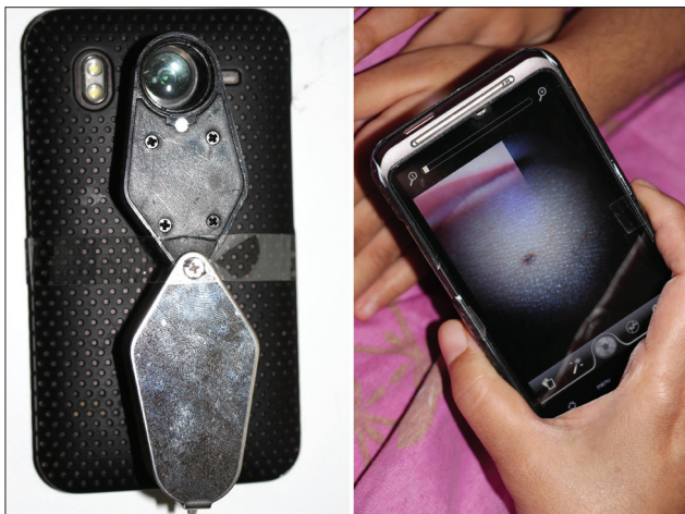
Figure 1: Jeweler's loupe attached to a HTC desire HD mobile phone with cello-tape and visualization of a melanocytic nevus with the loupe

Here, we present a simple device which can function effectively as a mobile dermoscope and can be a cheap and useful tool in mobile-phone enabled teledermoscopy.