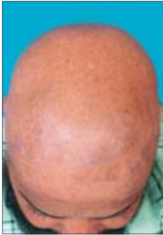
Figure 1: Alopecia areata progressing to totalis/universalis: Complete loss of hair over the scalp

later, he experienced spontaneous loss of hair over the legs progressing to involve other sites. In a short period of time, hair loss was noticed over the trunk, scalp and the beard area. It was accompanied by mild to moderate itching. However, hair loss was not preceded by any perifollicular papular or pustular lesions. The loss of hair over the scalp was total and was a source of embarrassment, which brought him for consultation. Examination of the skin was marked by loss of hair over the whole of the skin surface of the trunk, upper and lower extremities with patches of hair loss over the beard area. Hair pull test was positive. The complete loss of hair over the scalp was without any evidence of scarring or any skin lesion [Figure 1], which was characteristic of AA. Routine total and differential leukocyte count, complete hemogram and blood biochemical parameters were within normal limits. However, his random blood sugar was 197 mg (normal up to 140) and glycosylated hemoglobin (HbA1c) was 9.6 percent (normal 9%-10% fair glycemic control). The hematoxylin eosin stained biopsy section from the area of hair loss showed dense lymphocytic infiltrate in the dermis involving the receding remnant of hair follicles.