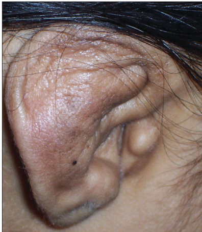
Figure 2: Shows deformity of right ear