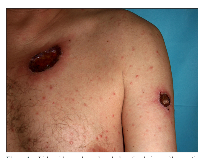
Figure 1a: Lichenoid papular rash and ulcerative lesions with necrotic center and peripheral erythema upon admission.

A 41-year-old Caucasian male presented with a 5-month-history of ulcerations over the face, the trunk and the upper limbs. The initial papules rapidly progressed to painless ulcers surrounded by an erythematous rim which subsequently developed haemorrhagic crusts at the periphery [Figures 1a and 1b]. The patient had fever up to 38.9°C, night sweats and