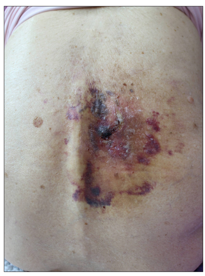
Figure 1: Focal erythematous to violaceous patches and plaques with some pigmentation and ulcerations on the patient's right back.

basosquamous carcinoma, Bowen's disease, metastasis, and angiosarcoma.<sup>2</sup> It is interesting to note that in WIR, the interval between primary and secondary diseases can vary widely, ranging from a few days to several years. Although numerous dermatoses have been reported to manifest as WIR, only five cases of BCC have been reported, with intervals ranging from 1 year to 35 years (mean 12.1 \pm 11.5 years).<sup>2,3</sup> In our case, the interval was 18 years. This highlights the importance of continuous follow-up and monitoring for the development of