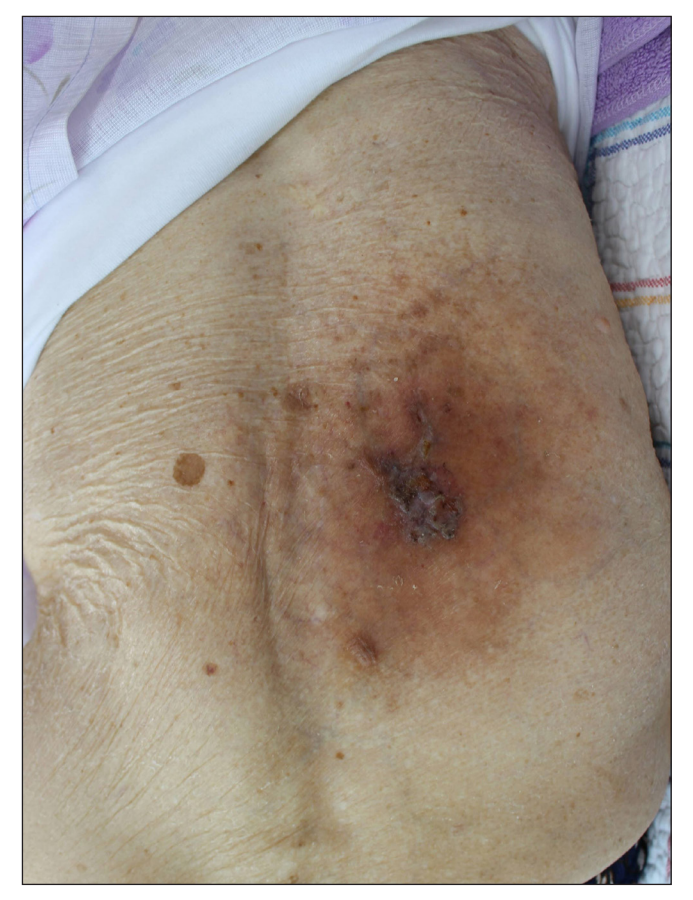
Figure 3: The size and thickness of the lesion reduced after 7 months of treatment

new dermatoses at sites of previous herpes zoster infections or skin injuries.