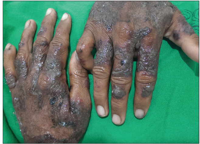
Figure 2: Well defined violaceous plaques and vesicobullous lesions on dorsal surface of hands

Among the myeloproliferative neoplasms, chronic myeloid leukemia (CML), atypical CML, and chronic neutrophilic leukemia were the most important conditions in the differential diagnosis. The first two conditions were excluded in view of mature neutrophilic leucocytosis, absence of immature precursors, or basophilia, normal leukocyte alkaline phosphatase score and negative results for BCR/ABL. Absence of thrombocytosis, megakaryocytic hyperplasia in bone marrow and negative JAK2 mutation excluded polycythemia vera and essential thrombocythemia. Absence of fibrosis ruled out primary myelofibrosis and absence of eosinophilia