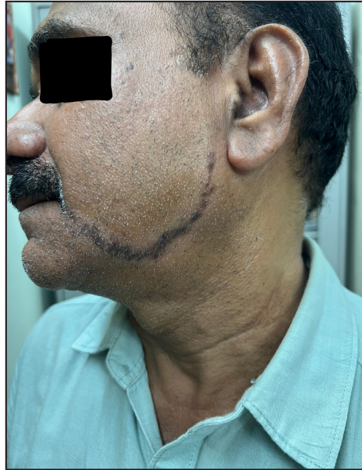
Figure 1: Hyperpigmented lesion along the lines of Blaschko extending from the left angle of mouth to left ear.

basal layer, features which were suggestive of lichen planus pigmentosus (LPP). LPP commonly presents as reticular or diffuse morphological types. Cases of linear LPP are rarely reported. The presence of lesions along the lines of Blaschko suggests that the predisposition to develop such lesions was probably determined in the early embryonic phase of life.